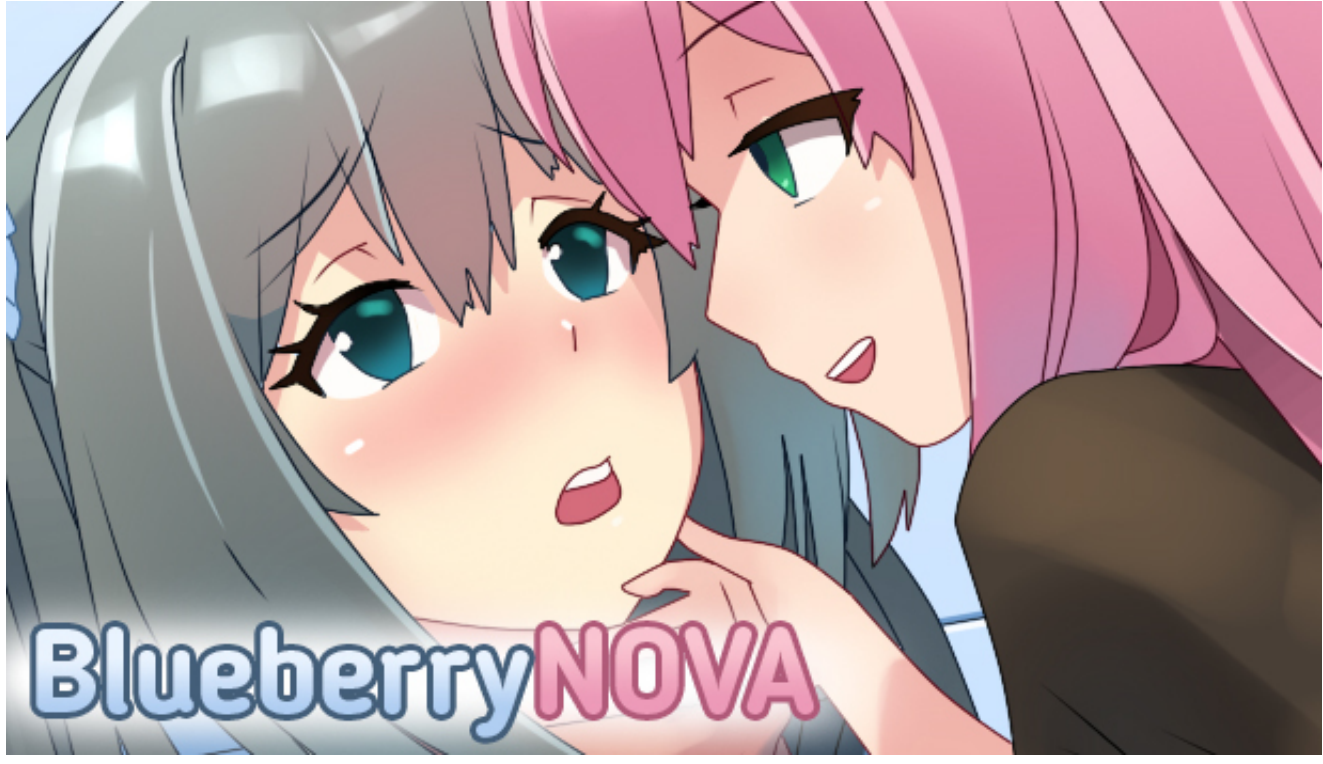
Patch 1.2.3 includes: